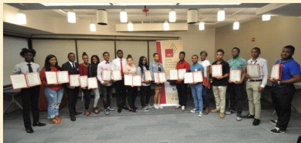
2018 KSEF Scholarship Recipients

You can contribute to the Named Endowed Scholarship Program in two ways: (1) A single lump-sum payment of the total amount. (Increments of $5,000) (2) A minimum initial down payment of at least one third of $5,000 with the outstanding balance being paid within three years of the initial contribution.