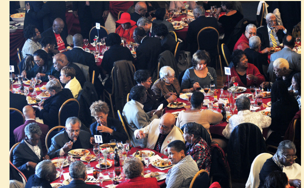
2018 Celebrity Auction