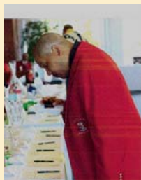
Guests look over the many items displayed at the Silent Auction.