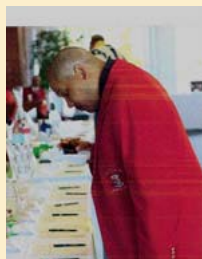
Guests look over the many items displayed at the Silent Auction.