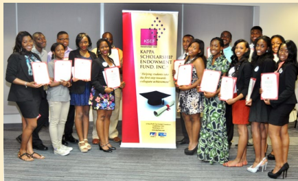
2013 KSEF Scholarship Recipients