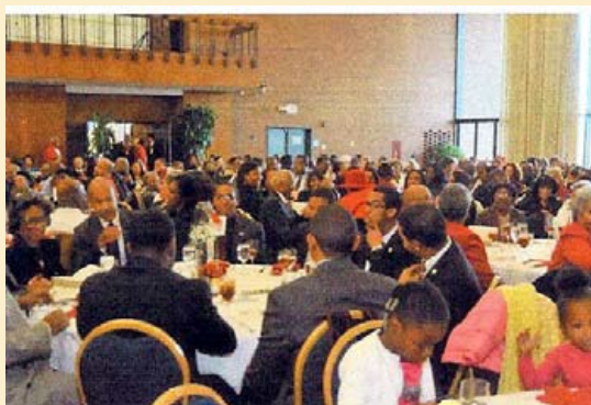
Guests participating in the festive action of the Live Auction.

The Celebrity Auction and Soul Food Feast is held annually in the Fall on the campus of Howard University. It is our major fundraising event. More than 700 supporters attend this event annually and it has been sold out for 30 years. Through the generosity of many individuals and businesses that contribute gifts and services for the Live and Silent Auctions, KSEF raises funds to support this scholarship program.